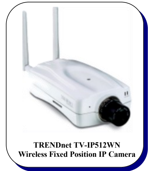
TRENDnet TV-IP512WN Wireless Fixed Position IP Camera

“A Proactive, 24x7 Security Shield to Help Protect Your Family and Your Home.”