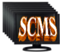
Surveillance Camera Monitoring Service (SCMS)

In addition to providing local/on-site monitoring capabilities, your new 24x7 Safety Shield ® system can be remotely monitored by a reliable surveillance monitoring service provider during off-hours, weekends, and holidays. In the event of an emergency situation, your staff and/or the appropriate first-responders will be immediately notified. All still images and/or videos related to the incident, will be stored in a secure video archive and will be available to you and your staff at any time.