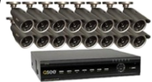
Sixteen-Camera CCTV Surveillance Camera System

“Our Surveillance Camera Systems Provides A Formidable Safety Shield For Your Employees, Your Customers, and Your Business!”